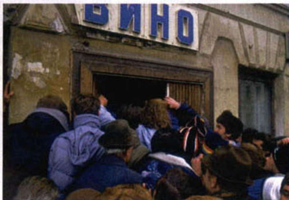
Clockwise from above: American students “duck and cover” during a school drill in 1951; fighting to get into a Moscow food store in 1990; the Soviet Union’s last leader, Mikhail Gorbachev; Soviet tanks and missiles on parade in 1971.