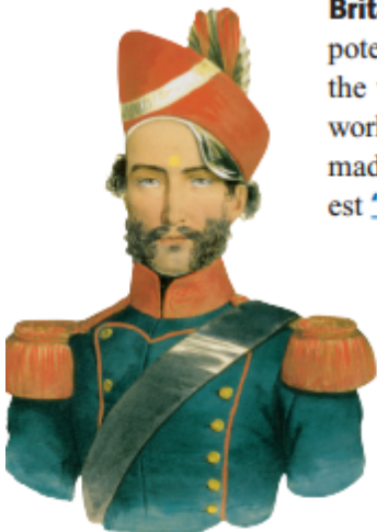
▼ A sepoy in uniform