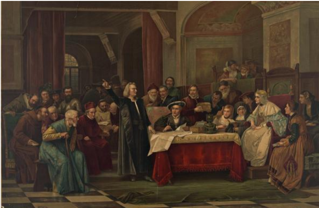
Explorer Christopher Columbus convinced King Ferdinand and Queen Isabella of Spain to support his westward voyages.

Thinking they were in the Indies, the Spanish soon called all the local people “Indians.”