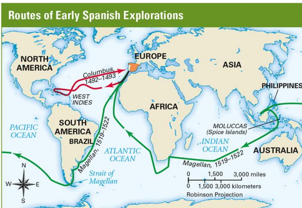
To increase their nation's power, Ferdinand and Isabella of Spain sponsored several expeditions in search of better trade routes and new lands to control.

Like Portugal, Spain looked to West Africa for new laborers. From 1518 through the mid-1800s, the Spanish brought millions of enslaved Africans to work in their American colonies.