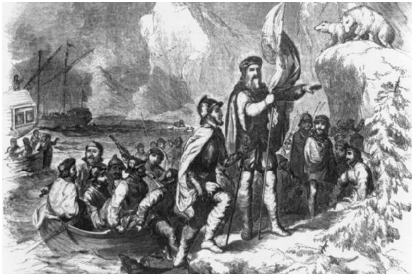
This early 20 th century illustration shows Henry Hudson meeting native people in North America.

In 1610, Hudson tried again, this time under the flag of his native England. Searching farther north, he sailed into a large bay in Canada that is now called Hudson Bay. He spent three months looking for an outlet to the Pacific, but there was none.