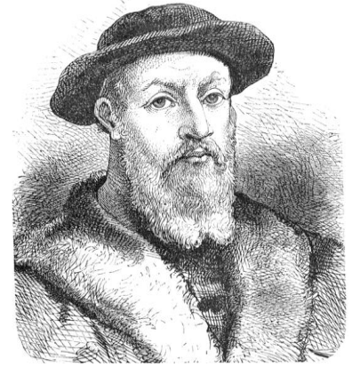
Ferdinand Magellan

After passing through the strait, Magellan reached the Pacific Ocean in November 1520. It took another three months to cross the Pacific. Continuing west, Magellan visited the Philippines. There he became involved in a conflict between two local chiefs. In April 1521, Magellan was killed in the fighting.