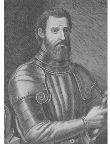
Giovanni da Verrazano

Hudson did not find a northwest passage, but he did explore what is now called the Hudson River in present-day New York State. His explorations were the basis of the Dutch claim to the area. Dutch settlers established the colony of New Amsterdam on Manhattan in 1625.