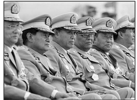
From 1962 to 2011, Myanmar (also known as Burma) was ruled by a military junta that was condemned by the world for its human rights violations.

In an oligarchy (OH-lih-gar-kee), a small group of people has all the power. Oligarchy is a Greek word that means “rule by a few.” Sometimes this means that only a certain group has political rights, such as members of one political party, one social class, or one race. For example, in some societies, only noble families who owned land could participate in politics. An oligarchy can also mean that a few people control the country. For example, a junta is a small group of people—usually military officers—who rule a country after taking it over by force. A junta often operates much like a dictatorship, except that several people share power.