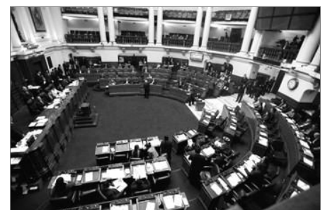
The Peruvian legislature