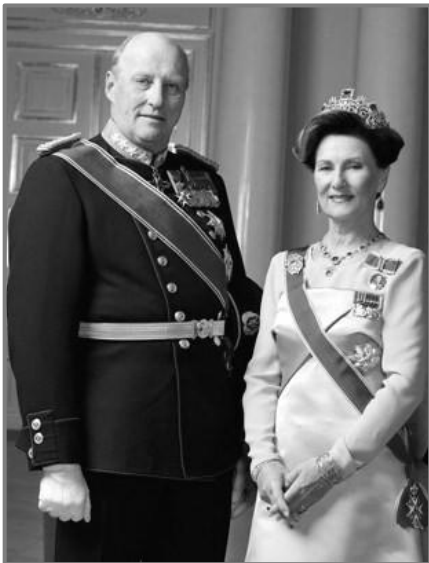
King Harald V of Norway with his wife, Queen Sonja. Norway is a constitutional monarchy. The king is the head of state and has a mainly ceremonial role. The actual government is a democracy.