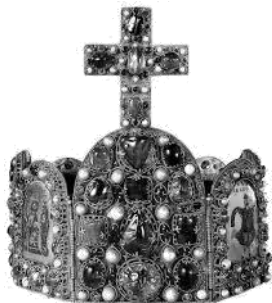
Crown of the Holy Roman Empire, which was tied to the Catholic church and lasted from the 10th—19th century.