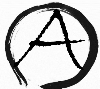
An A inside a circle is the traditional symbol for anarchy.

In an anarchy , nobody is in control—or everyone is, depending on how you look at it. Sometimes the word anarchy is used to refer to an out-of-control mob. When it comes to government, anarchy would be one way to describe the human state of existence before any governments developed. It would be similar to the way animals live in the wild, with everyone looking out for themselves. Today, people who call themselves anarchists usually believe that people should be allowed to freely associate together without being subject to any nation or government. There are no countries that have anarchy as their form of government.