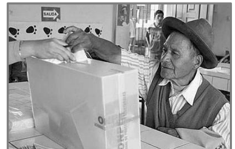
A man votes in Peru.

In a direct democracy , there are no representatives. Citizens are directly involved in the day-to-day work of governing the country. Citizens might be required to participate in lawmaking or act as judges, for example. The best example of this was in the ancient Greek city-state called Athens. Most modern countries are too large for a direct democracy to work.